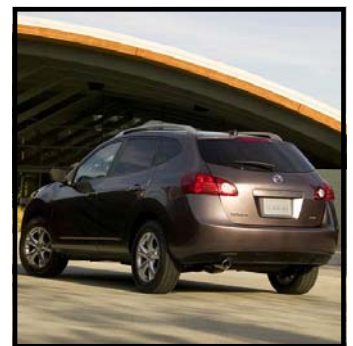
The Rogue is a stout competitor in the small crossover SUV market.

At the conclusion of this tour, Mason had traveled about 10 months this year!