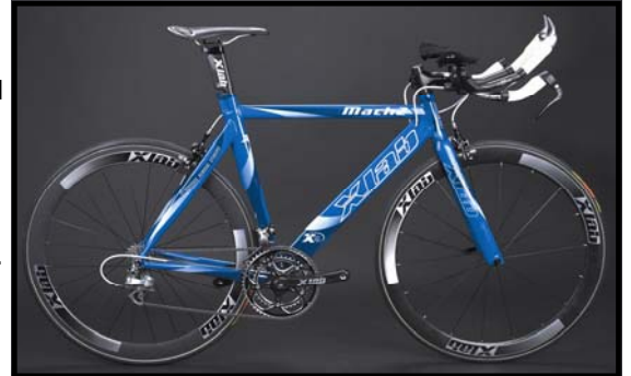
Mason will have a road rocket very similar to this one to ride at the next time trial.

Robert Keating customized a pair of Shimano® carbon fiber shoes just for me. If I’m not fast on this new bike, all I can say is that the engine is down on power!”