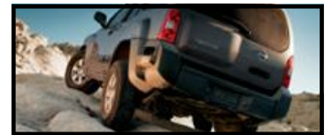
“Xterra’s hallmark is its functionality”

Xterra’s hallmark is its functionality. There are 10 tie-down hooks in the rear, four 12-volt power outlets and plenty of cargo configurations to handle just about anything you can think of (inside or up on top).